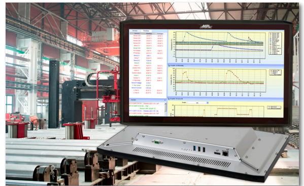
PANEL18 Solution with standard connectors