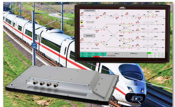
PANEL18 Solution with M12 connectors