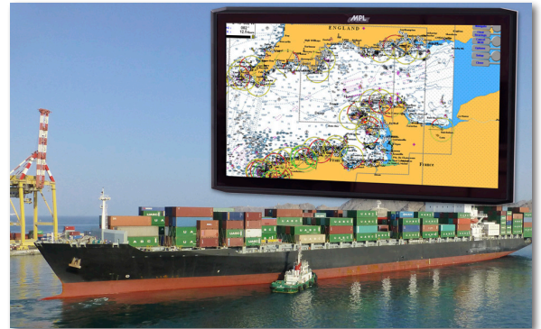
PANEL18 used in maritime environment

All MPL products are fanless, shock and vibration proof, low power, rugged, and long-term available. The perfect solution for a system to be used in rugged environments.