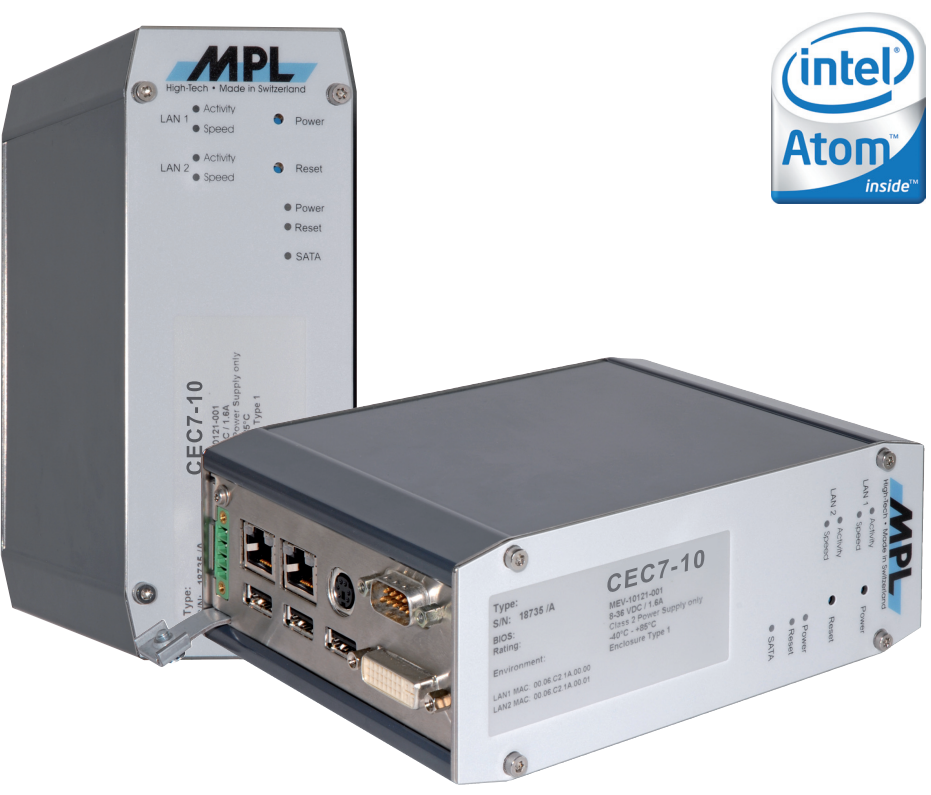
CEC7 dimensions: 62 x 162 x 120 mm (W x H x D) Compact rugged aluminum housing with stainless steel side plates

the CEC7 to the ideal solution for applications where a low power consumption, ultra Compact Embedded Computer is required. The CEC7 can be used in application like transportation systems, telecom and in tough industrial automation applications.