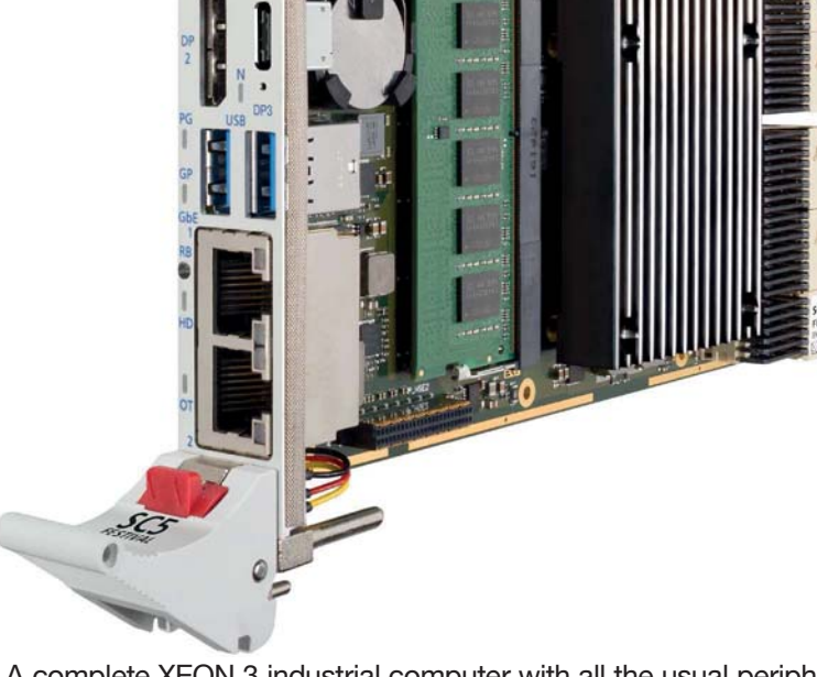
Pic.1 : A complete XEON 3 industrial computer with all the usual peripherals on a single euroboard of 3U and with only one slot space requirement (4HP).

A typical industrial computer based on CompactPCI Serial with a 3U European card format generates a power loss of 50-80W in the form of waste heat with its XEON 3 processor. Such systems typically use high-performance graphics cards based on the NVIDIA GeForce GTX or the Quadro family, for the visualization of raw data, pre-processing and events. This adds up to 150W again. It is easy to network these systems via the built-in Ethernet interfaces or the CompactPCI Serial Backplane [1], thus further increasing the computing power. Systems with 5 or 8 CPU modules are easily possible without problems. Easily? Yes, if the high power loss of more than one kilowatt inside the volume of barely more than a shoebox would not overwhelm normal cooling systems.