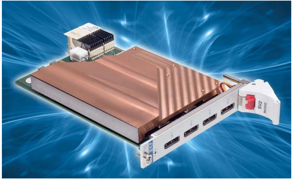
Pic.4: The entire waste heat of this video module is collected and transferred to the upper end surface (bottom left in the picture)

These transfer modules are connected to the primary heat exchanger and have a high thermal efficiency and thus ensure the very efficient heat transfer. As a result, the modules can be plugged into the subrack at any time in the field and can be easily removed