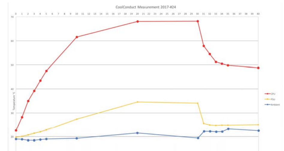
Pic.3: Temperature inside the rack at several measurement points. T=0 Starting system w/o CoolConduct. At T=30 starting of the coolant pump. At T=35 stable conditions.

The primary heat exchanger cools the processor and graphics modules in the rack and transfers the heat via the medium to the secondary heat exchanger. This is mounted underneath the vehicle, transversely to the direction of travel, and transfers the heat to the